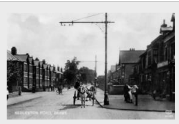
Kedleston Road in about 1914

Find out who went away to fight from our area, listed under the Community named Six Streets Derby.