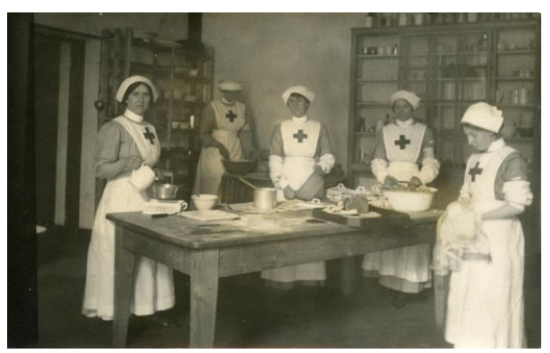
Photograph of VAD Nurses

So far, much of our research has concentrated on the men who went away to fight, so it was with some excitement that we heard that the Red Cross have started to release their records of First World War volunteers, many of whom were women. The Red Cross organised units called Voluntary Aid Detachments, known as VADs. Volunteers were trained in first aid and nursing.