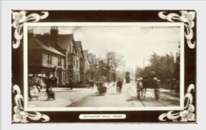
Postcard of Kedleston Road, about 1911 published by F W Scarratt.

If you have any information about people who lived in the Six Streets area during World War 1please contact us at