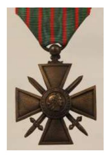
Croix de Guerre Medal, Wikimedia Creative Commons Image

Photo of Laurence Mills, Derby Daily Express 11 September 1916